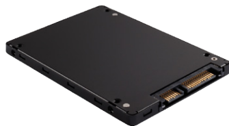
2.5-Inch Form Factor